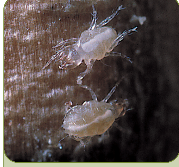
Predatory mite Cheyletus eruditus