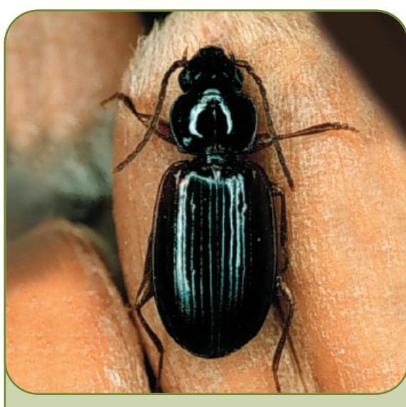
Ground beetle Carabidae