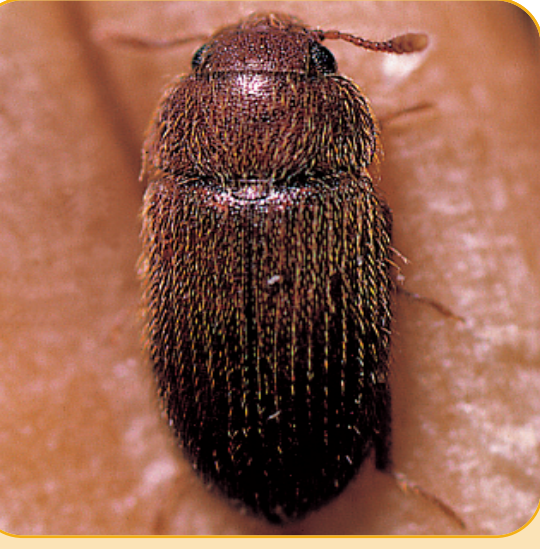
Hairy fungus beetle Typhaea stercorea

White-shouldered house moth Endrosis sarcitrella