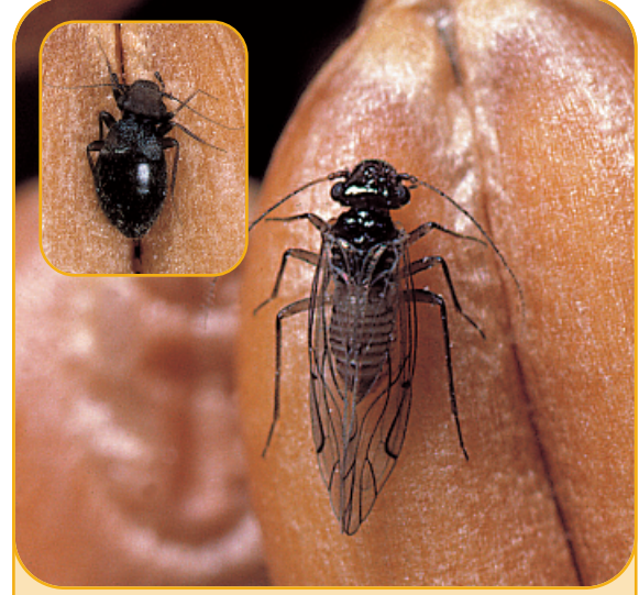
Booklice (two species shown) Psocoptera