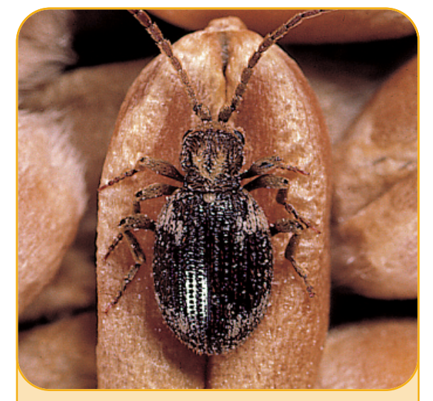
White-marked spider beetle Ptinus fur