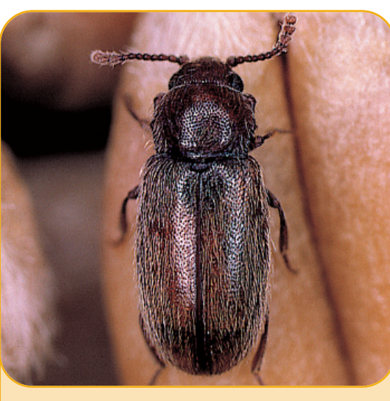
Mould beetle Cryptophagus species