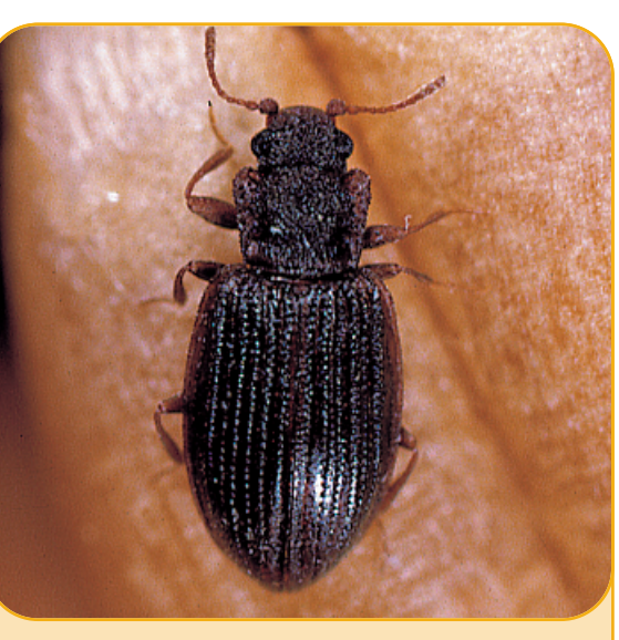
Plaster beetle Lathridiidae