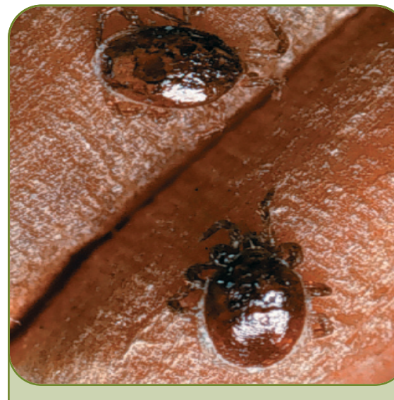
Predatory mite Gamasina