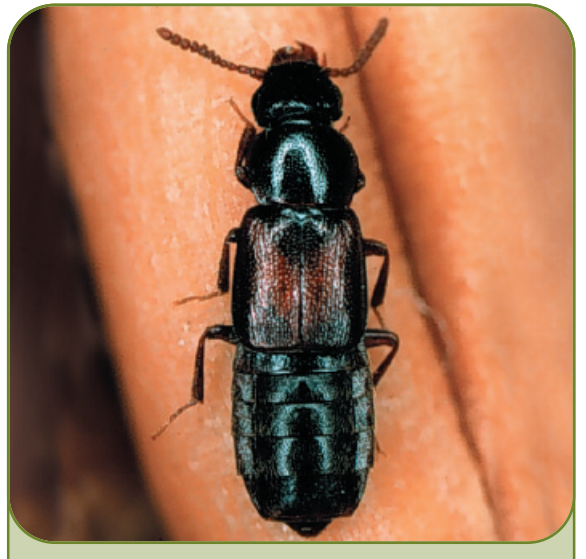
Rove beetle Staphylinidae