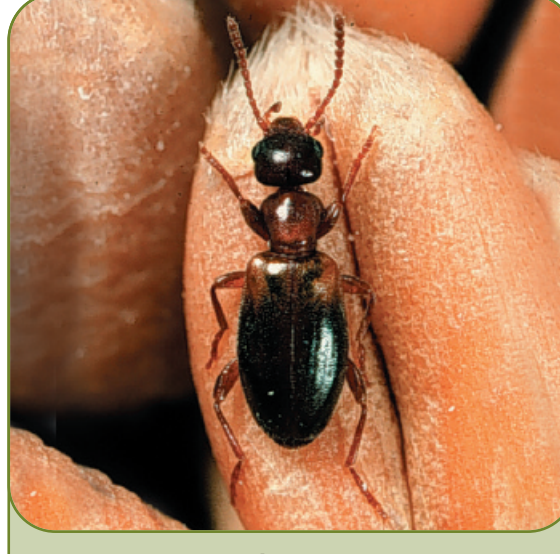
Narrow-necked harvest beetle Anthicus floralis