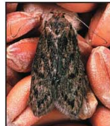
BROWN HOUSE MOTH Hofmannophila pseudospretella