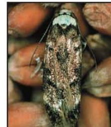
WHITE-SHOULDERED HOUSE MOTH Endrosis sarcitrella