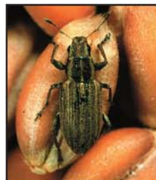
CLOVER WEEVIL Sitona species