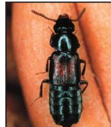
ROVE BEETLE Staphylinidae