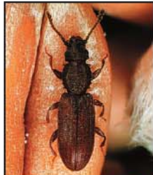
SAW-TOOTHED GRAIN BEETLE Oryzaephilus surinamensis

These are the more common of over 50 species that may occur in grain stores. Correct identification is important. For advice and an identification service please contact The Food and Environment Research Agency using the details given below.