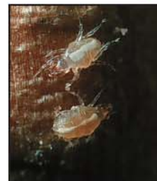
PREDATORY MITE Cheyletus eruditus