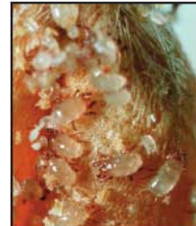
FLOUR MITE Acarus siro