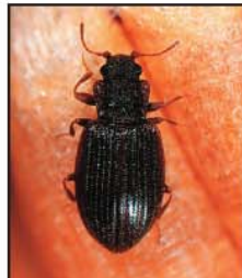
PLASTER BEETLE Lathrididae