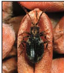
WHITE-MARKED SPIDER BEETLE Ptinus fur