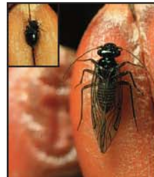
BOOKLICE (2 species shown) Psocoptera