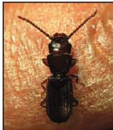
RUST-RED GRAIN BEETLE Cryptolestes ferrugineus