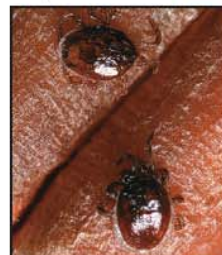
PREDATORY MITE Gamasina