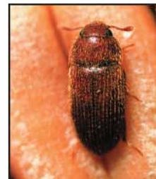
HAIRY FUNGUS BEETLE Typhaea stercorea