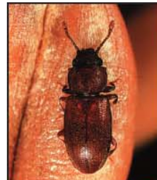
FOREIGN GRAIN BEETLE Ahasverus advena