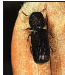
LESSER GRAIN BORER Rhyzopertha dominica