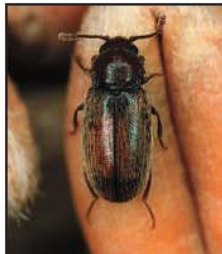
MOULD BEETLE Cryptophagus species