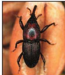
GRAIN WEEVIL Sitophilus granarius