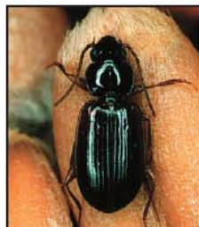
GROUND BEETLE Carabidae