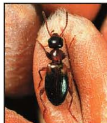
NARROW-NECKED HARVEST BEETLE Anthicus floralis